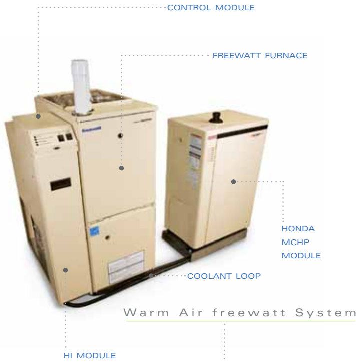
Warm Air freewatt System