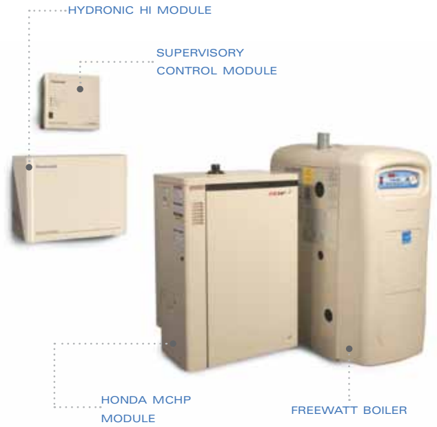
Hydronic freewatt System