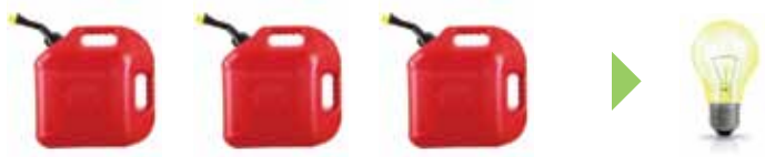
Fuel Used by Power Plant ▶ 290 W Fuel for 100 W