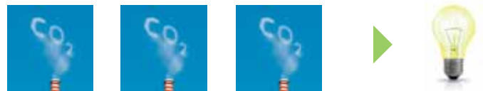
CO 2 Emissions from Power Plant